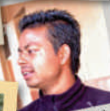
Rakesh Bandwal Virtual Risk Calculator